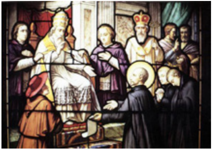
Part of stained glass window in cas-tle Loyola, Spain. Approval of Jesuits order by Paul the III in 1540 Rome.