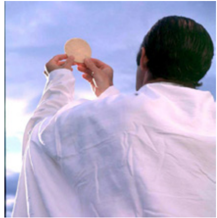
Catholic celebration of the eucharist

ya 7:28; 9:28). Kiri kijumo hali Yesu kuba ogamba n’omuhonga buhayaka buli kasumi obworukuba nolya omugati n’okunywa Vinyo nkooku kiba omu kusembera kw’Abakatuliki. Kinu nikyoleka kurungi nkooku batarukwikiriza ekyonzira kya Yesu okuba nikimarra kimu habw’ okutujuna ebiibi byaitu.