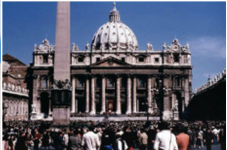
Ekitebe kya Papa omu Vatican

Matini Luza arukaba namanya kurungi ensita ez’Ekelezia Katolika akagamba ati: “Kibi muno okuta amaiso hali omuntu arukwetwara wenka nkomusigirwa wa Kristo, arukweyoleka munyakitinisa muno neky’ omukama atasobora kuhikaho. Mara si obu araisisana na Yesu arukabali munaku, rundi Petero arukaba nayebundaza wenka? Bagamba uwe mukama w’ensi! Baitu uwe Kristo owarukweyeta misigirwa we, uwe akagamba ati; ‘Obukama bwange tibuli bw’ensi enu. Hati obulemi bw’omusigirwa we burakira obwa mukama we?’” (D’Aubigne, book 6, chap. 3).