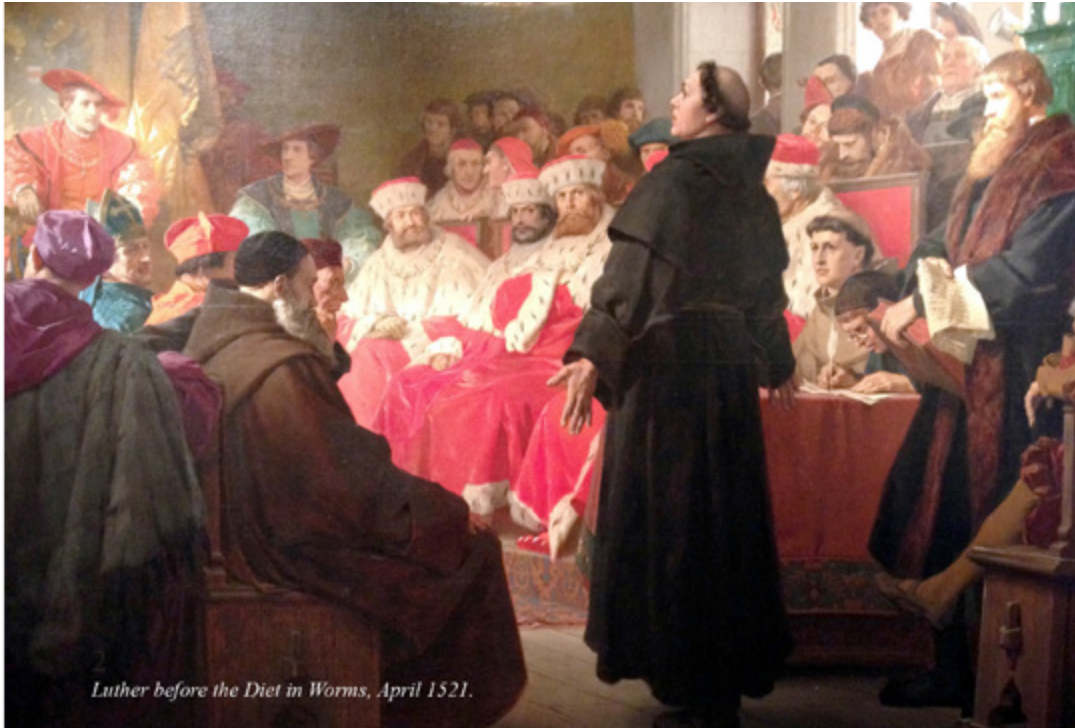
Luther before the Diet in Worms, April 1521.

Omu kasumi ako abahereza omu Kelezia na Abasesorodoti bonka nibo baikirizibwaga kuba na Baibuli; kandi abantu nubo bonka batahoga amaiso okumanya ebya Ruhanga. Bayesig-waga okuba nibasoborra kurungi ek-igambo kya Ruhanga. Matini Luza, n'ensonga ze 95 kandi n'okutebeza