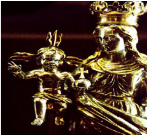
Ekibumba kya Madonna ali n’om-wana ekijwire ebwokuroraho bwin-gi obwa Bakatoliki. Omukono gwa Kristo n’obwarra busatu burozire haiguru, nkooku arukusisana omuka-toliki. Omungaro harumu ensi, kandi n’omusalaba gw’obukatoliki guli hai-guru y’ensi. Nosobora kugamba ngu Ekelezia Katolika n’ekora na Kristo kulema ensi yoona.

Enkurakurana enu nebaho ha rulengo rw’byendema, mudiini, ebyentahya hamu n’enkurakurana. Guli mulimo ogurukugenda mpora kandi nigut-wara emyaka nyingi – nikikolerwa omu nsita kandi mpora muno. Omu bwire butali bwa hara abo abataruk-worobera ebiragi-ro byensi yoona kabibe bya Amahanga rundi Ediini ni-baija kwetwa baikazi abajemi. Nibai-ja kuba n’okufubirwa rundi bahanwe omu miringo endi yoona. Okukozesa kubi obusobozi omu bwa Papa nik-wija kurorwa omurundi ogundi, baitu oihireho abo abali nibahakaniza en-kozesha mbi ey’obusobozi bunu kandi nabo baliba beteranize hamu nabo. (Okusuku’rwa 13:11-17). Baibuli niyo erukusukura kinu kandi naitwe nitwikiriza ekigambo kya Ruhanga.