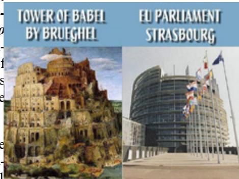
Babel Tower EU Parliament Babylon Strasburg